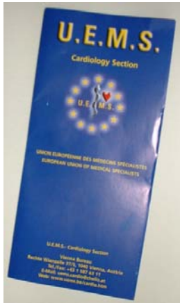
Fig. 3 The first flyer 2001